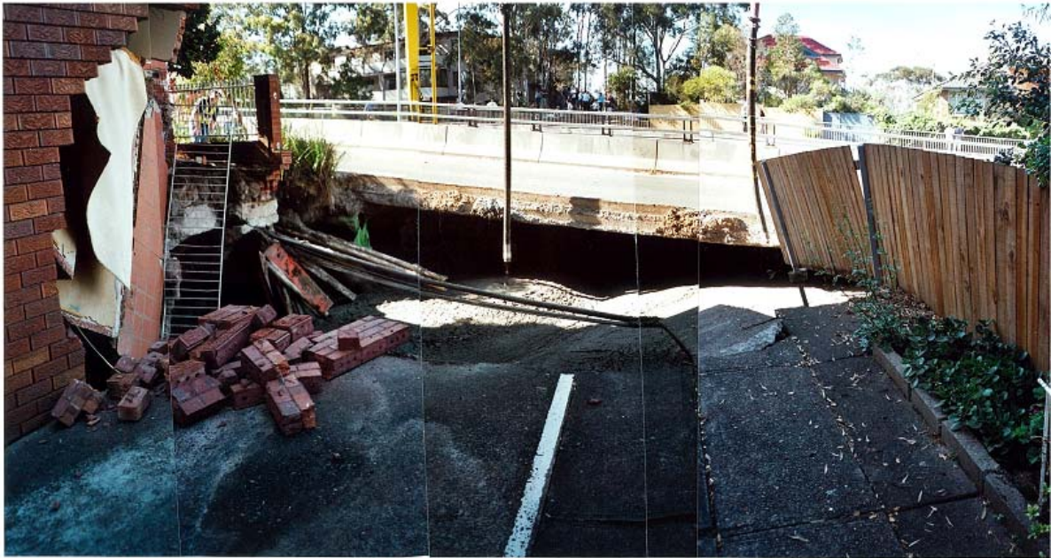
Pacific Highway Off-Ramp and south western corner of Kerslake Apartments. Void backfilling with concrete 3 rd November 2005 Plate 4