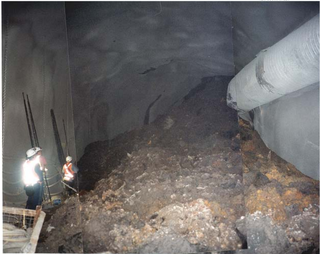
Collapse debris in MC5B ventilation Tunnel, 3 rd November 2005 Plate 3