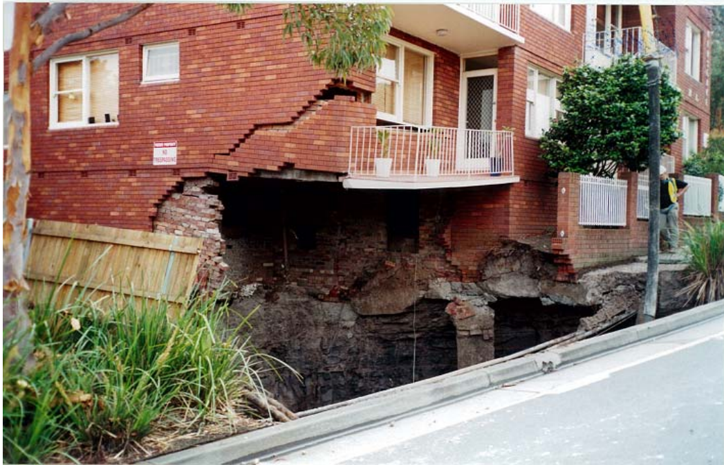
Damage to the unit block at 11-13 Longueville Road, Lane Cove Plate 1

supported the Pacific Highway off-ramp. The incident caused the off-ramp and Longueville Road to be closed and residents of the home units to be evacuated.